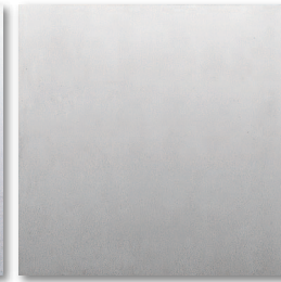
Stainless steel cast alloy