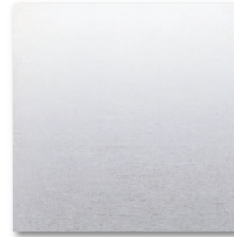
Fine zinc alloy